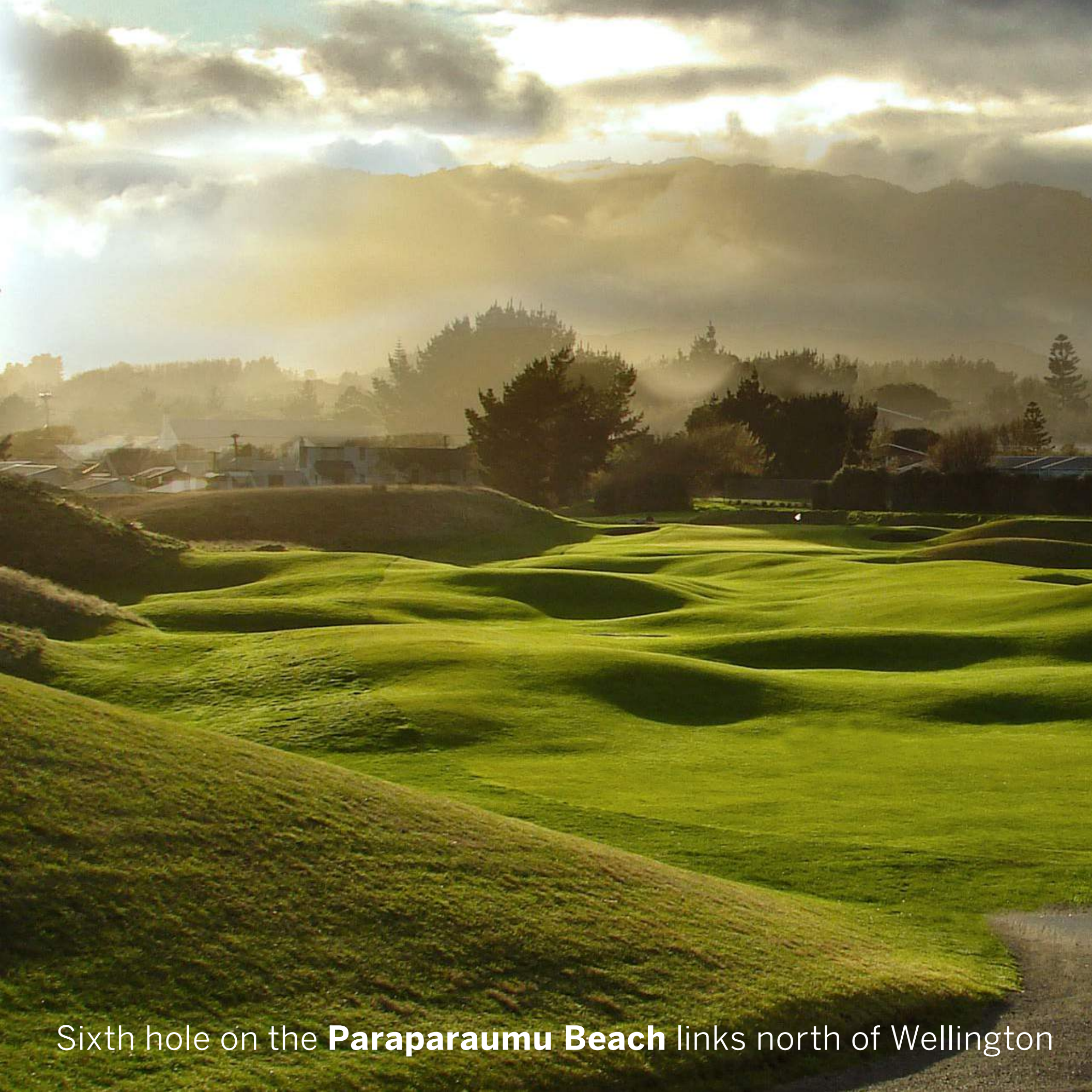
Sixth hole on the Paraparaumu Beach links north of Wellington