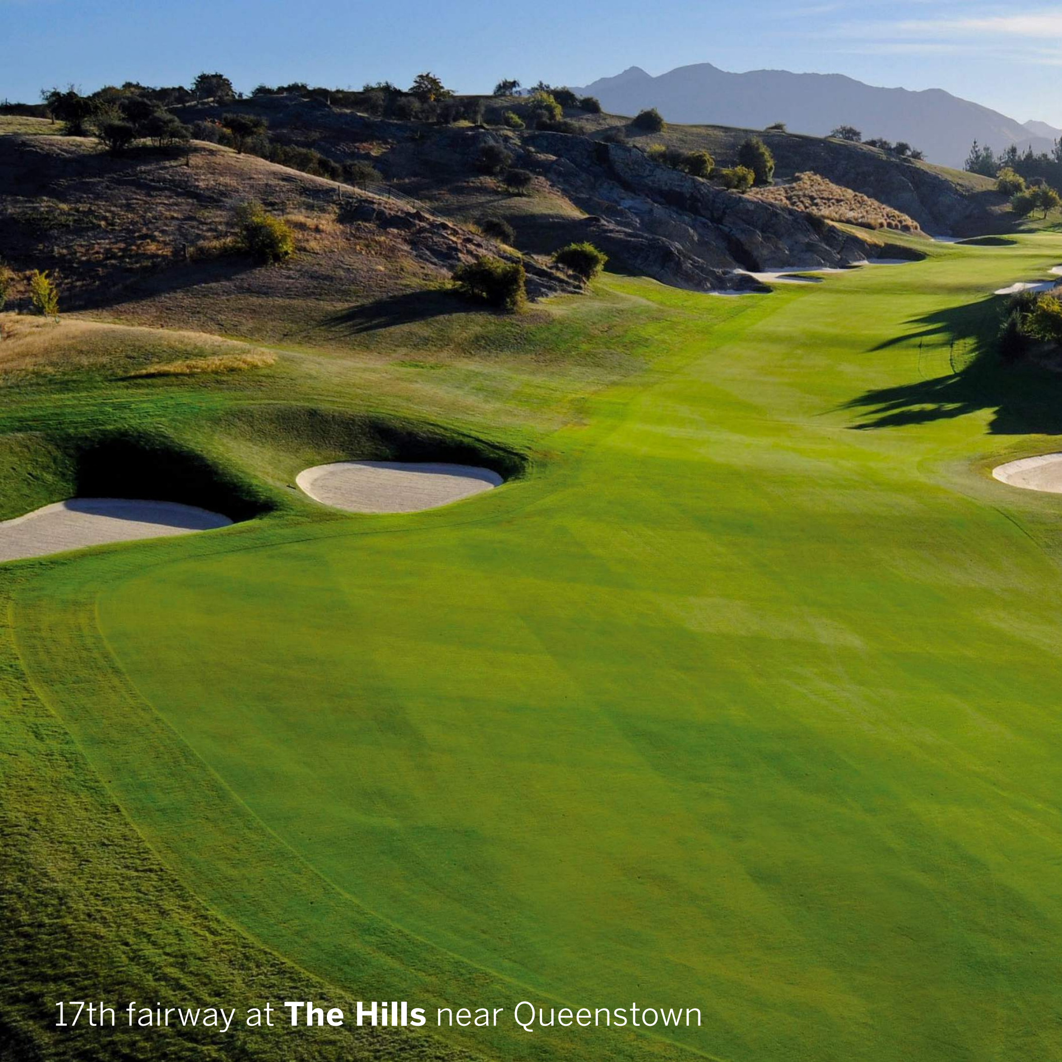
17th fairway at The Hills near Queenstown