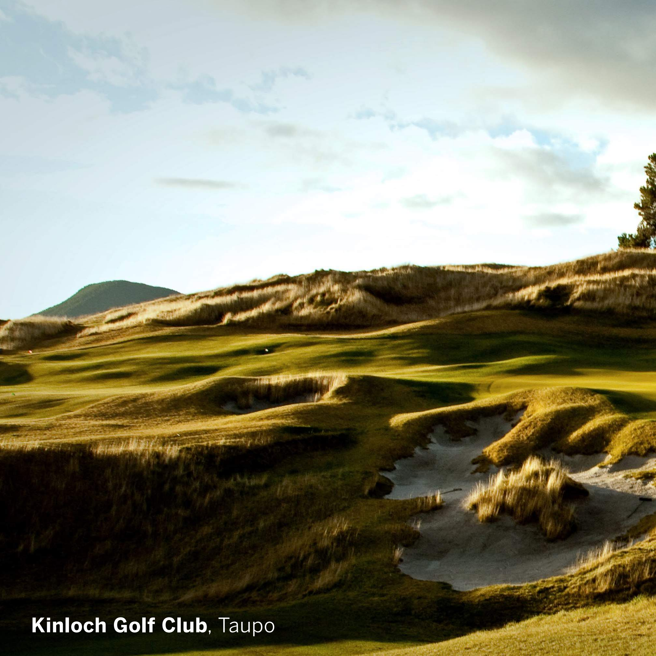
Kinloch Golf Club, Taupo