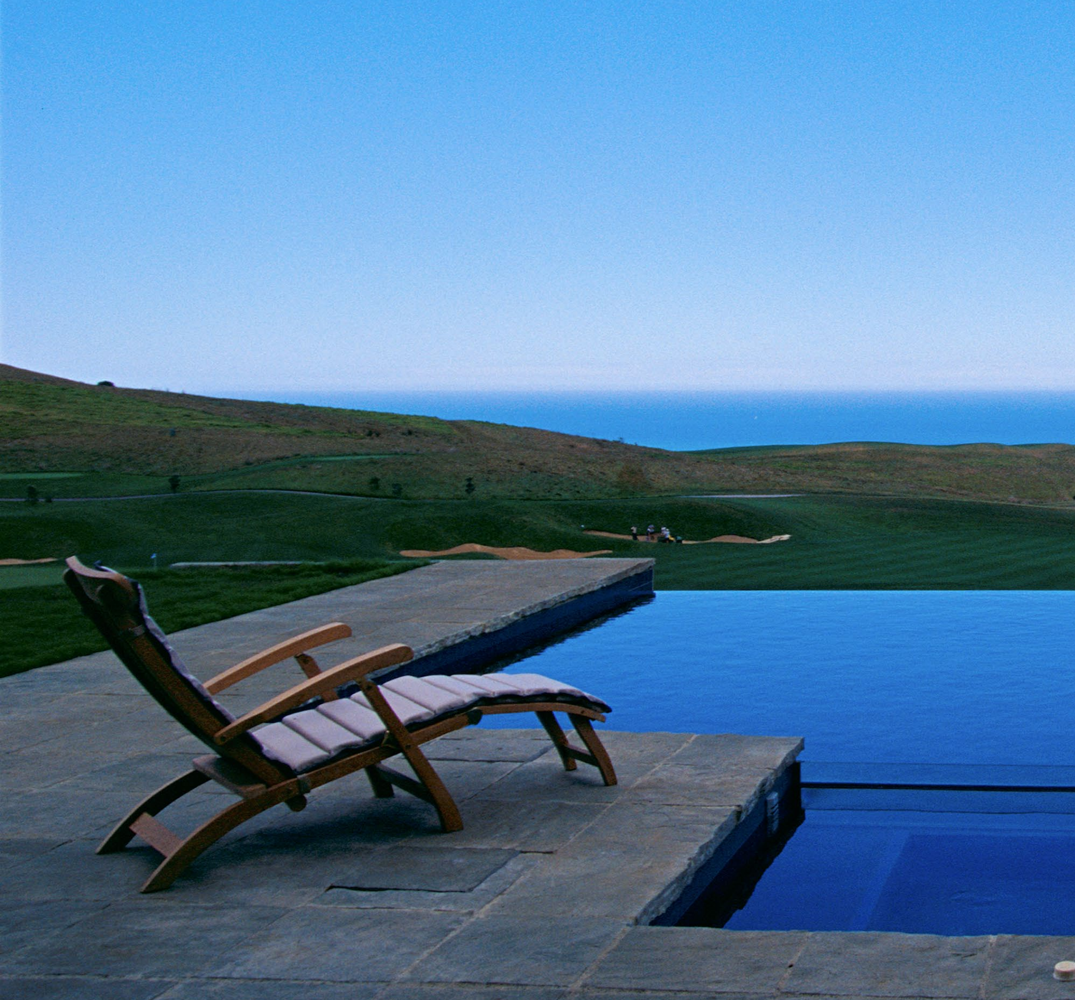
Owner's Cottage at The Lodge at Kauri Cliffs