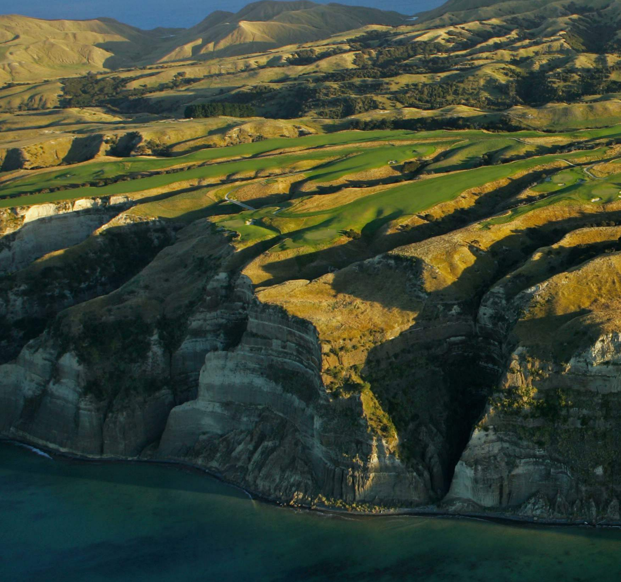
The “fingers” on the Cape Kidnappers course