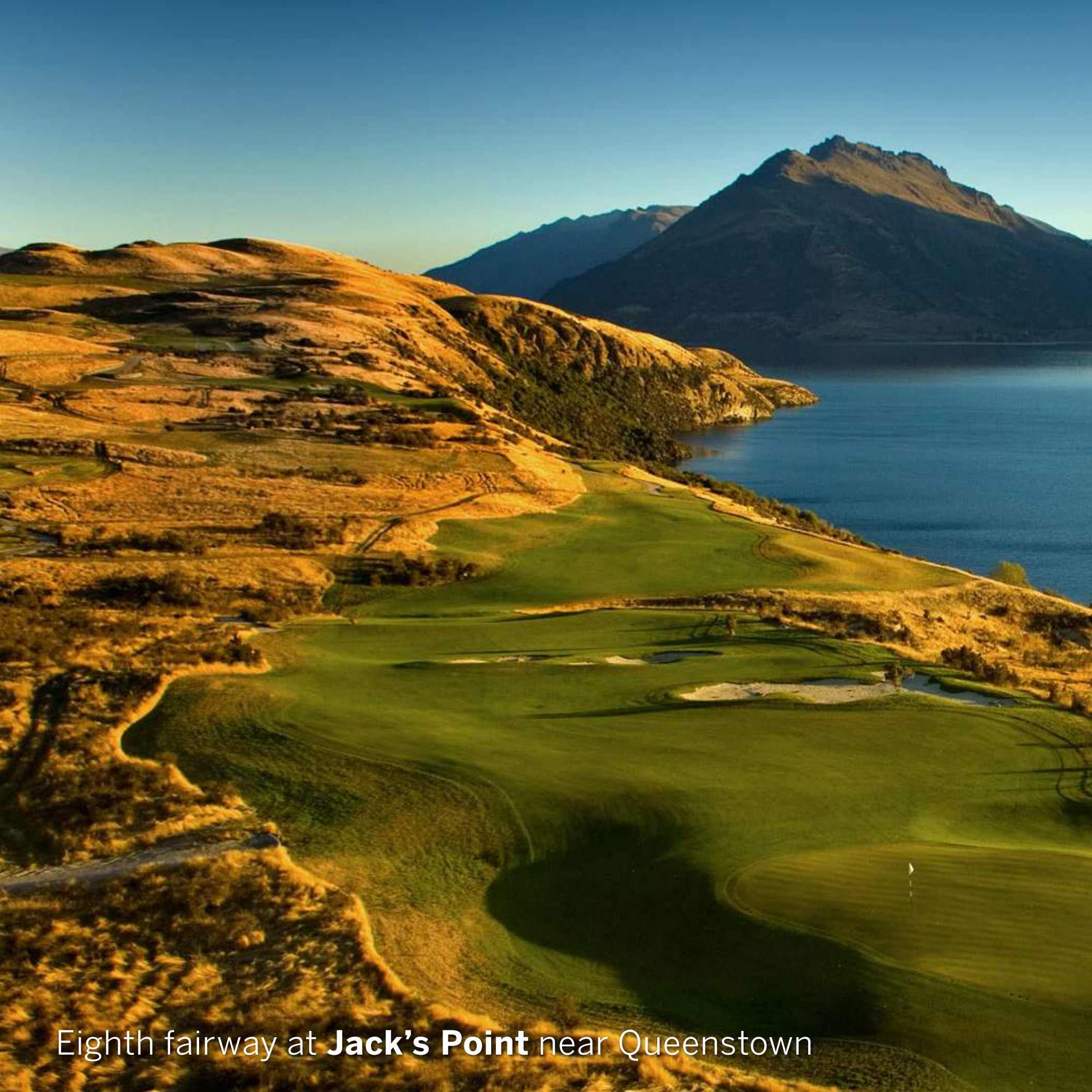
Eighth fairway at Jack's Point near Queenstown