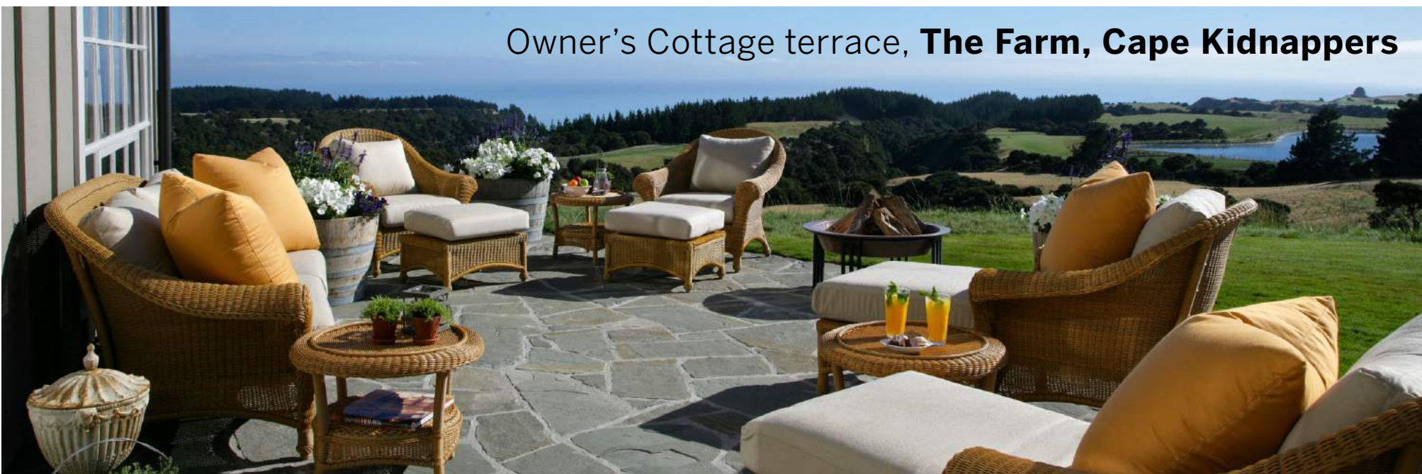
Owner's Cottage terrace, The Farm, Cape Kidnappers

The Farm, Cape Kidnappers opened in 2007 and sits on a working 6,000-acre sheep and cattle spread overlooking the Pacific. Once again, Robertson built only a handful of cottages to keep the maximum number of guests below 50. The resort's wood-and-stone lodges resemble a cluster of weathered farm buildings. Appearances can be deceptive, however, and the 22 lavish suites come with a full range of modern technology and private balconies with sensational bay views.